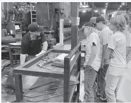
Pictured above: MMS 8th grade students visited Epiroc's Wain-Roy facility where they learned about the processes involved in manufacturing a wide variety of buckets for excavating equipment.

In October, Mosinee Middle School's 8th grade students participated in the Heavy Metal Tour 2023 to learn about the many job and educational opportunities in manufacturing that are available in the Central Wisconsin area. This year students toured AROW Global , Epiroc , Crystal Finishing Systems , and G3 Industries where they were able to see a first-hand look at a variety of manufacturing processes. The tours were then followed by a walk-through of the NTC campus in the area dedicated to education for industrial jobs including the welding facilities and the robotics labs.