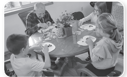
Pictured above: Students work on a pumpkin art project with one of the residents.