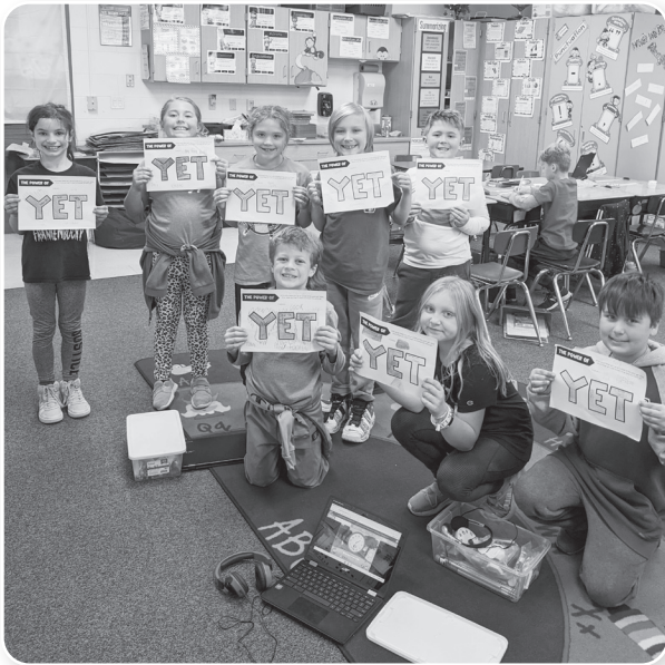
Pictured above: Students in Mrs. Seeger's class learn about the "Power of Yet" – I can't...YET!

Each month, Mosinee School District will focus on one of The 7 Habits® . Students will participate in activities to learn more about the habit and how they can apply the principles to their lives.